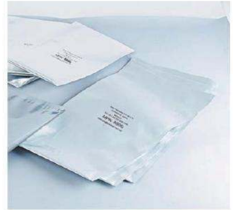
MPK-8800 Static Shield Moisture Barrier Bag